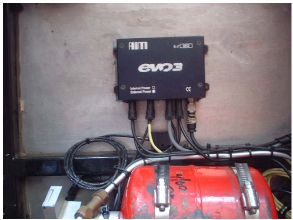
The box is attached with Velcro – soft side on the car, hooks on the box.